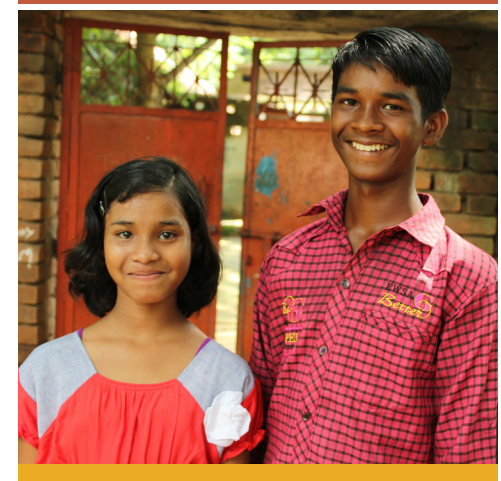
Their hearts are beaming because they now have a place to call home, and two loving parents to care for them. Thank you!

Most people are shocked to hear that I don't like spending time in orphanages. The truth is, after 5 years and meeting 1,000+ children who don't have families, it still hurts my heart to visit an orphanage. It's not easy, and it shouldn't be. My chest gets heavy and I try not to cry every time I leave. Children deserve family and seeing children without families is hard.