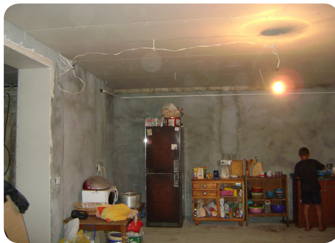
The kitchen- cinder block walls, open wiring and no table for the family to sit and eat together!

This remarkable family recently moved to a larger home in order to adopt three additional children, but the home was in dire need of repair. The kitchen was cinder block walls with open wiring and no table for their family to be able to sit at and eat together. Now, because of you, the Vedernikov family has a safe and warm kitchen!