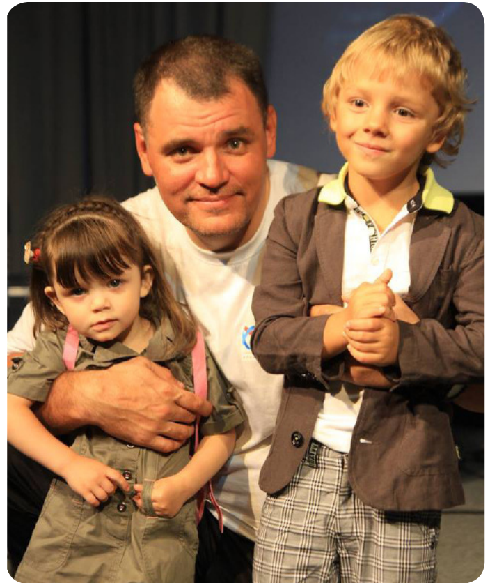
Thank you for helping these two children find a forever family!

Thank you for supporting former orphans as they biked over 3,000 miles across Russia to encourage believers to adopt!