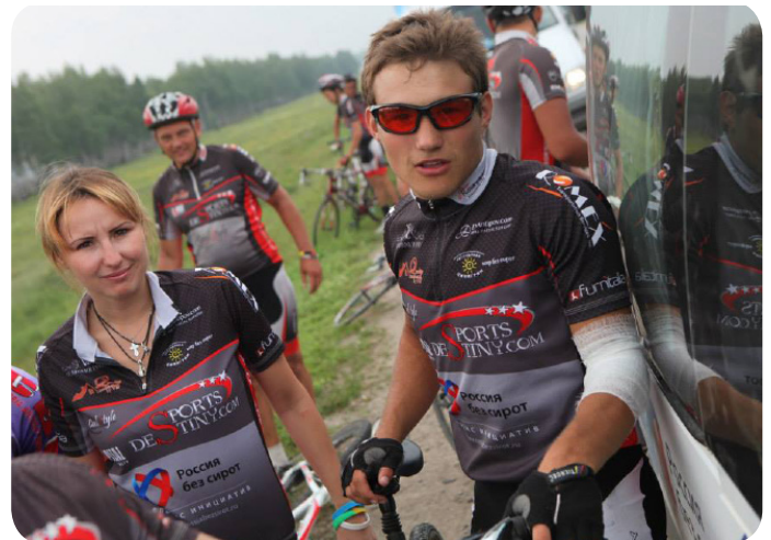
Brave bikers after a long day on the road.

Stories are continuing to pour in about families who were motivated to adopt after meeting these brave kids and hearing them speak!